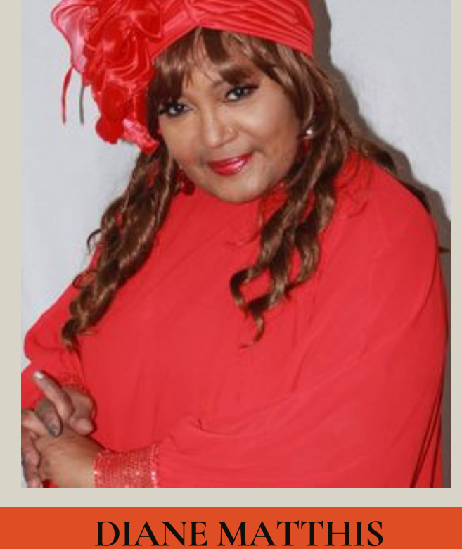
'AN UNSUNG SHERO WHO SHOWED ME LOVE' Singer, Songwriter, Theatre Producer - USA Once toured as backing singer with with Ray Charles, The Platters, Issac Hayes,