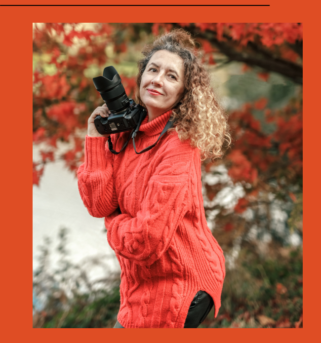
LUDA BAMFORTH PHOTOGRAPHY, TENACITY & FAITH

Portrait Artist Portrait Oil Paintings - USA