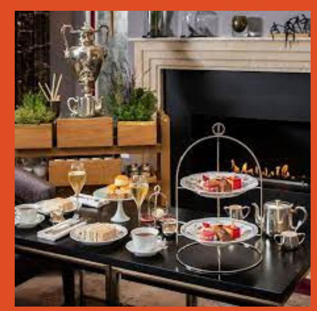
THE BILTMORE LXR MAYFAIR